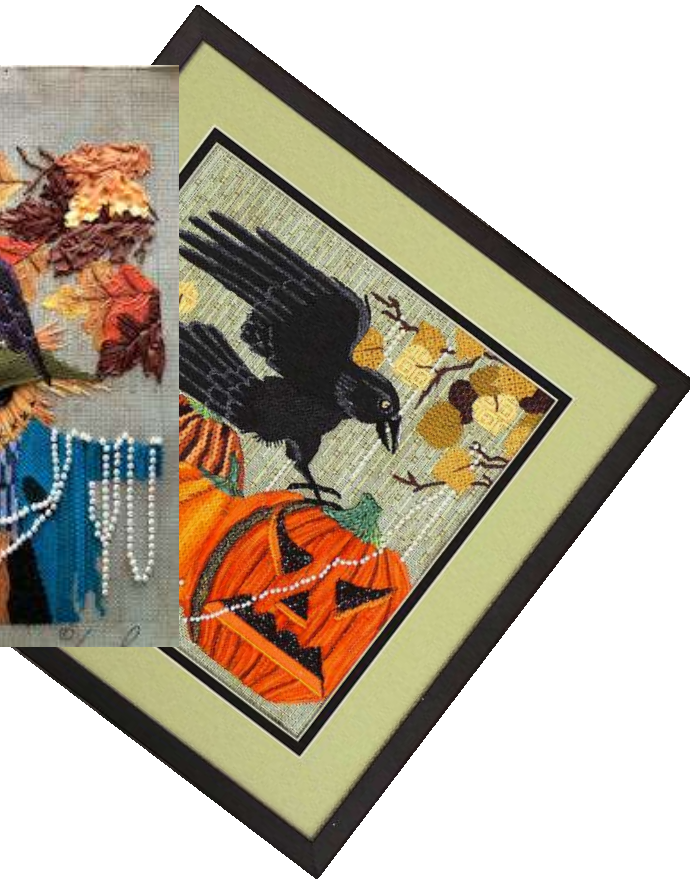
Inquire for Details

Host one class featuring all three designs! Customers may stitch one, two or all three!